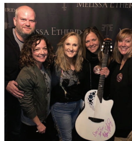
BACKSTAGE MELISSA ETHERIDGE GREET PINK AID VIPS