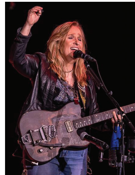
MELISSA ETHERIDGE AT THE PARAMOUNT