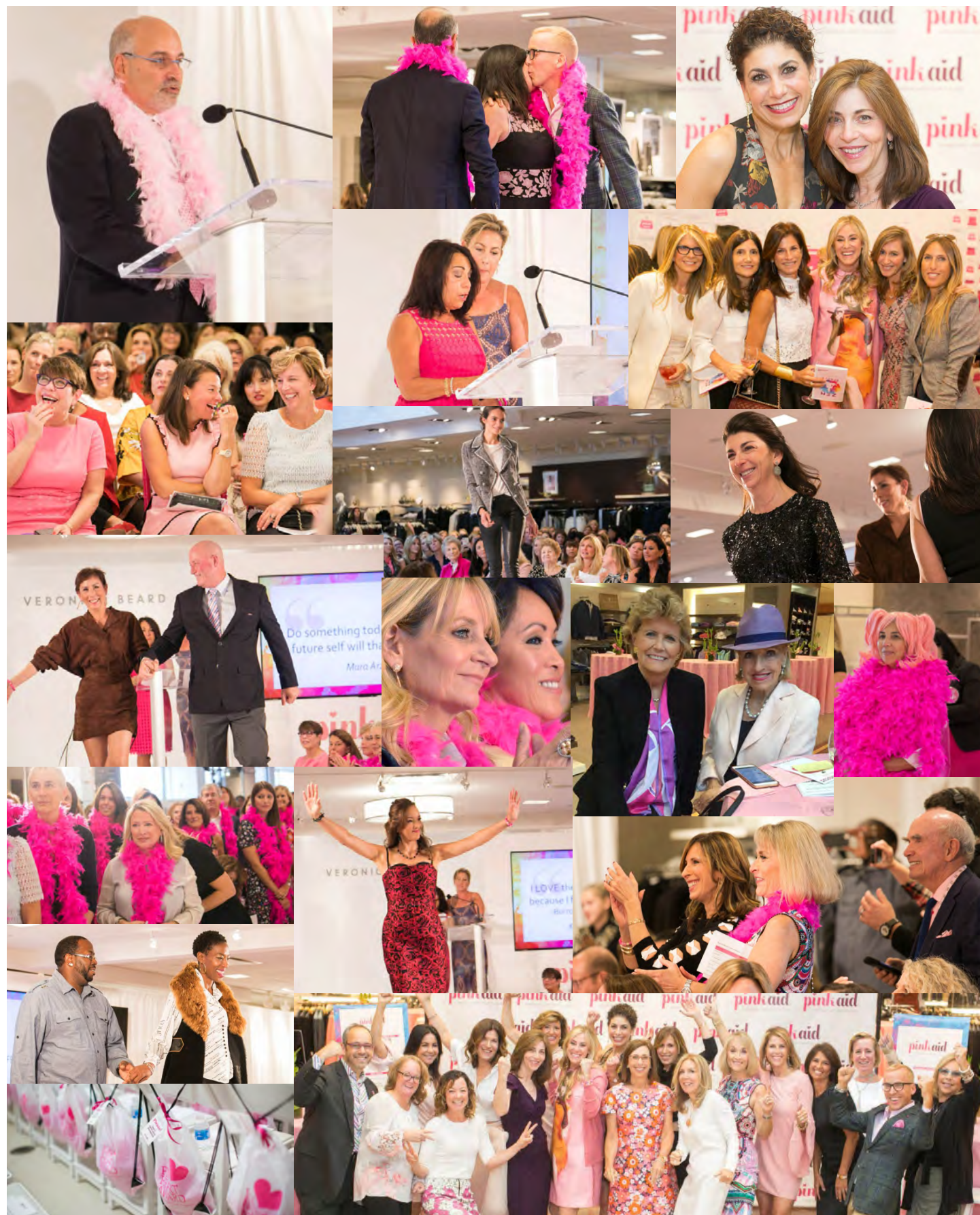
Pink Aid's Seventh Annual Luncheon & Fashion Show — Oct. 5, 2017