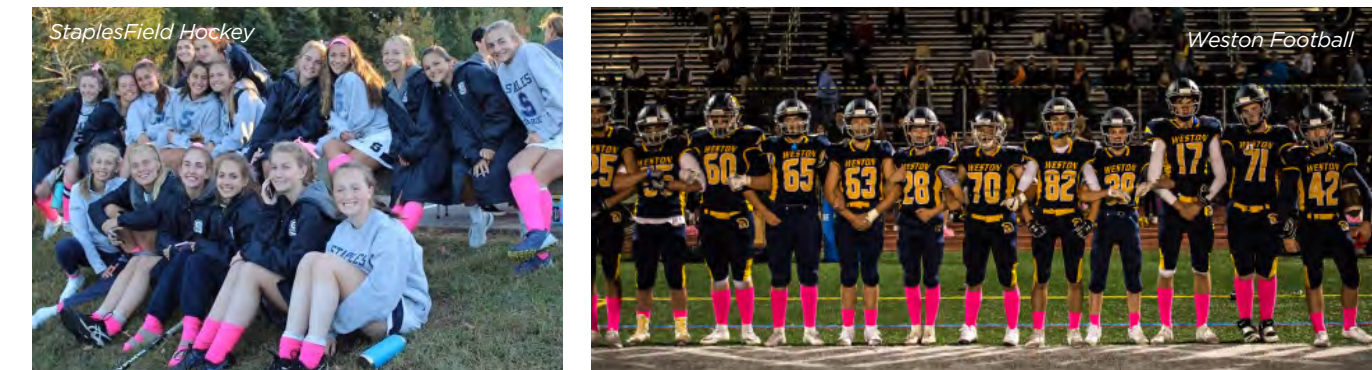
Thank you once again to Staples Football, Staples Field Hockey, Weston Football, Weston Volleyball, Weston Girls Soccer, and St. Luke's School for supporting Pink Aid in the month of October.