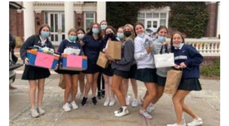
Pink Aid's Pink Posse delivered 50 bags to 5 hospitals in the Connecticut area in honor of Breast Cancer Month. Each bag had a $25 gift card to Stop and Shop, a blanket, slippers, and various other items to help patients during treatment.

November 4th - "Reading with Robin" proceeds from Authors' Event book sale