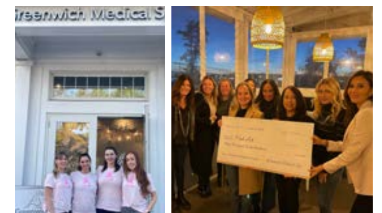
Greenwich Medical Spa In recognition of Breast Cancer Awareness month. Greenwich Medical Spa employees wore pink every Thursday, and GMS generously donated a percentage of sales from all their locations to supporting Pink Aid!